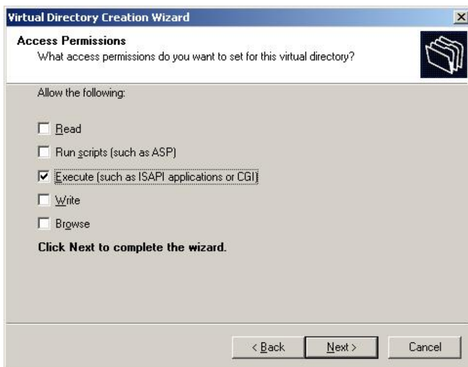
Figure 5-7: Enabling CGI Mode