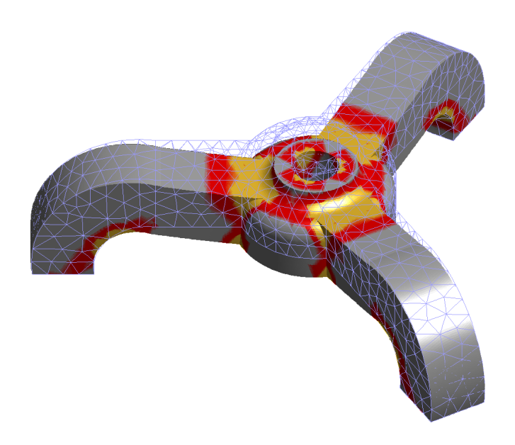
Fig. 1: deformed tripod

Here is the final figure, displaying the Von Mises stress: